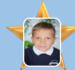
Maison Red 3