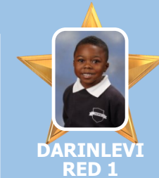
DARINLEVI RED 1

To book please follow the link https://instituteofimagination.cmail19.com/t/i-l-nbhdik-gdlxulyk-d/ .