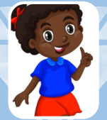
Mirabel Red 4