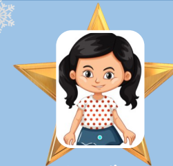
Saamika Green 2